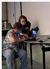
A CPA Connects 2 U participant works with a Smart Share volunteer

A grant from The McGregor Foundation allowed us to purchase laptops and Wi-Fi hot spots that were distributed to residents of our six communities. Limited-data plans were also purchased, giving those seniors a head start on getting and staying connected. Additional funding for the program was provided by the Cleveland Clinic.