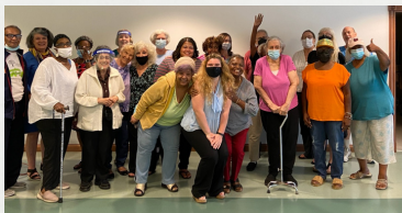
CPA Connects 2 U graduates celebrate the end of class!

CPA Connects 2 U is a unique program in that it matches trained Smart Share volunteer mentors with older adults for maximum learning and retention.